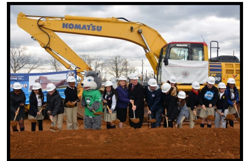
Groundbreaking ceremony for the new Halloran Elementary School