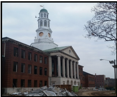
TCHS prior to demolition

Prior to demolition activities, the DIY network television show ‘ Salvage Dawgs ’ worked with the demolition contractor to film two episodes which recently aired and showed salvage activities at the school.