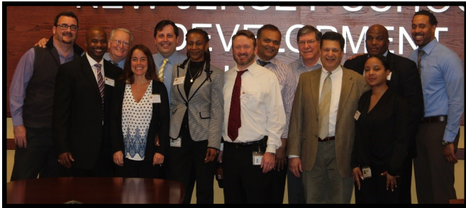
2016 SMWBE Contractor Training Presenters

Please visit our website for more information about the SMWBE Contractor Training Program.