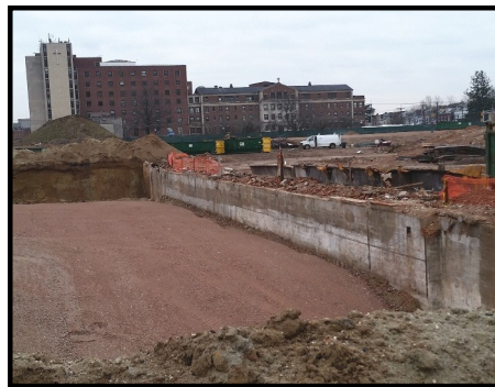
TCHS after completion of demolition