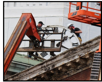
‘Salvage Dawgs’ taping