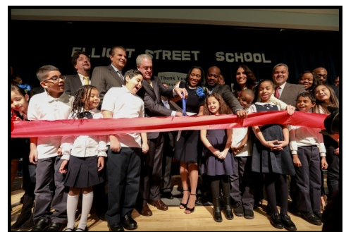
Ribbon cutting for the new Elliott Street Elementary School