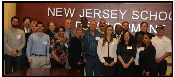
2016 SMWBE Contractor Training Graduates